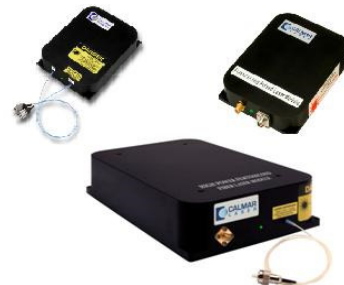
Perfect building blocks for systems integration

Small form factor Ruggedized packaging Shock and vibration proof Air cooling High reliability Long term stability Low maintenance Low cost of ownership