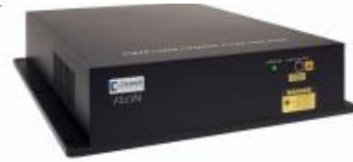
Cazadero high pulse energy femtosecond fiber laser

Beam Quality TEM_{00} , M^2 1.2 Repetition Rate up to 200 KHz Capable of Synchronizing to external RF clock