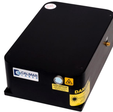
Mendocino OEM seed 780 nm laser

Average power > 10 mW Wavelength 780 nm Pulse Width < 100 fs Beam Quality TEM_{00} , M^2 1.1 Repetition Rate 30 MHz